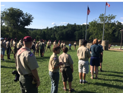
July - Troop 36 at summer camp Camp Rock Enon, Gore VA