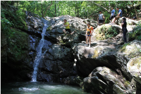
August – Troop 36 rock jumping along Cedar Run Trail

Trinity and Washington Baptist joined together and hosted a Leadership Camp for local teenagers in June, and Crew 36 scouts participated. Mornings were full of classroom sessions and team games which taught skills important to leaders. The afternoons were spent implementing those new skills while the teens worked together to build a brick patio behind Washington Baptist Church. This course and community service hours were the culmination of requirements Scouts needed to earn their Discovery Award in Venturing.