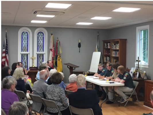
June – Crew 36 Forum talk about books that had a formative impact

Trinity and Washington Baptist joined together and hosted a Leadership Camp for local teenagers in June, and Crew 36 scouts participated. Mornings were full of classroom sessions and team games which taught skills important to leaders. The afternoons were spent implementing those new skills while the teens worked together to build a brick patio behind Washington Baptist Church. This course and community service hours were the culmination of requirements Scouts needed to earn their Discovery Award in Venturing.