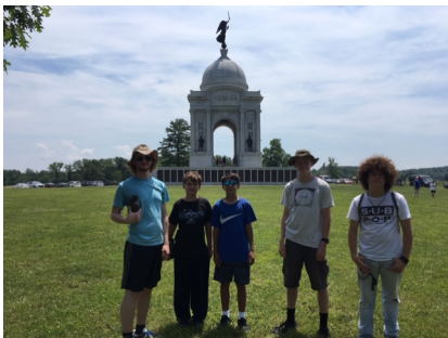
June - Troop 36 touring battlefields of Gettysburg, PA