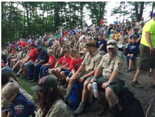
Camp wide fireside program

Trinity’s youngest scouts attended a week of resident camp at Camp Rock Enon, Gore, VA.