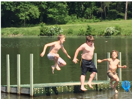
Swimming in Miller Lake