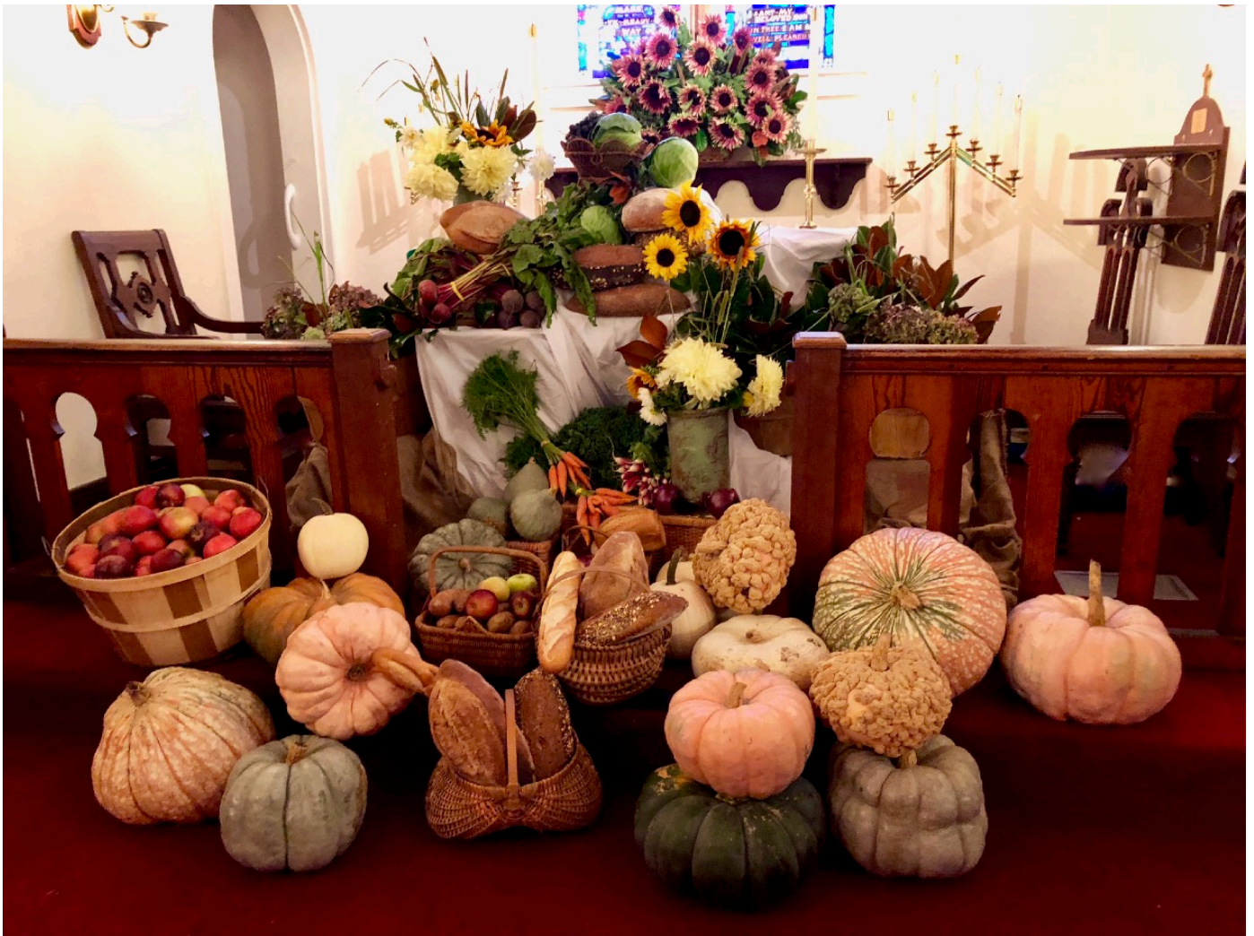
Gathering Together in Thankfulness for the Bountiful Harvest