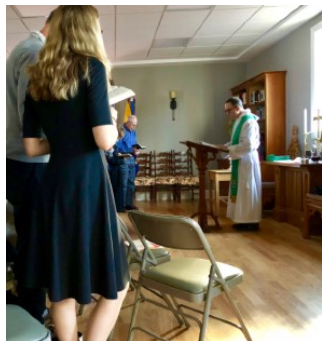
No Electricity, No Problem