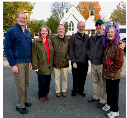
Making the Rounds on Halloween Night