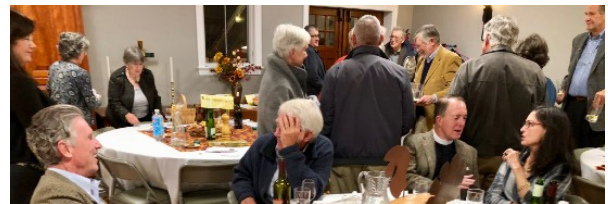
More from the Harvest Dinner