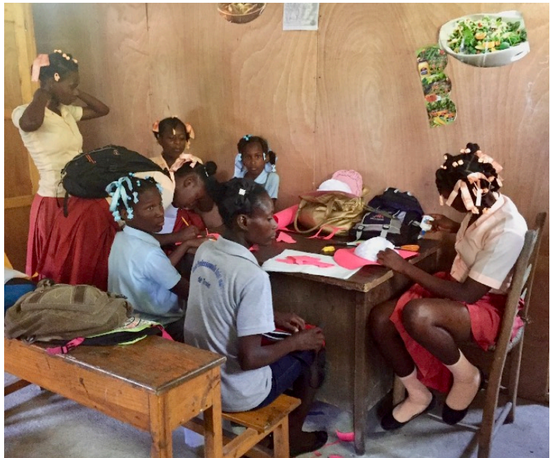
Pictured: Sewing & Flower Arts Class in Haiti