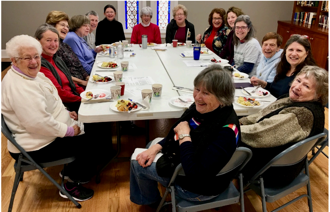
The first meeting of Women's Fellowship in the newly refurbished Parish Hall

Wed, Mar 29 6:00pm Community Lenten Series, Washington Bapt. Church