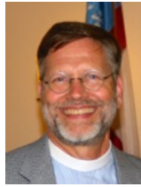
YOUR MONTHLY BILL